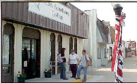
THE EXTENSION CENTER - BUSHNELL