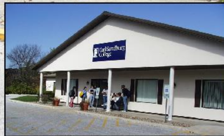
THE BRANCH CAMPUS - CARTHAGE